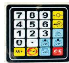
Colour Coded Keypad