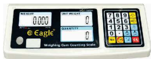
3 Display Windows