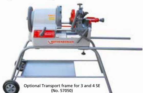
Optional Transport frame for 3 and 4 SE (No. 57050)