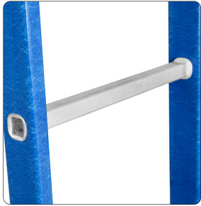
Square rungs for better footing and comfort