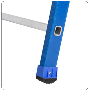
Slip resistant foot for maximum grip on any surface