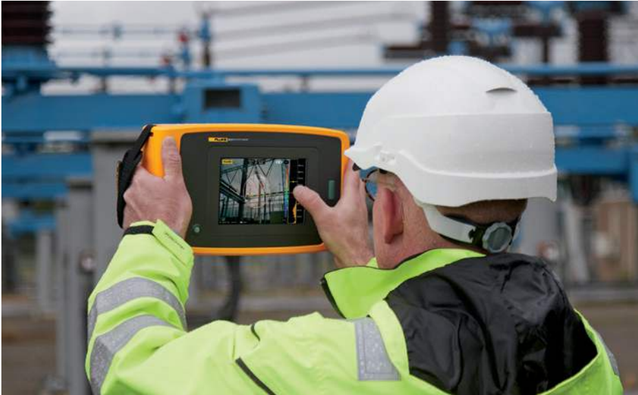
Image taken of the ii910 Precision Acoustic Imager detecting partial discharge in a high voltage application.